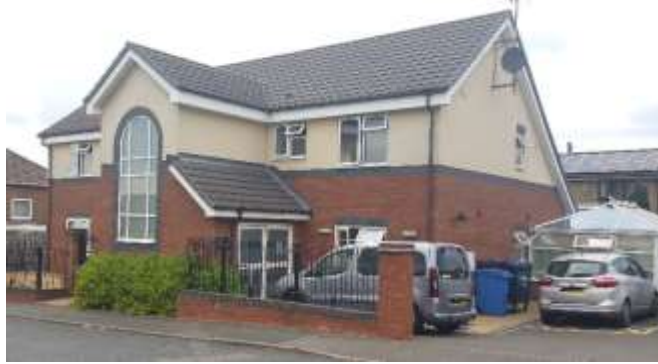
Wellcroft House, 11 Wellcroft Street, Wednesbury WS10 7HU